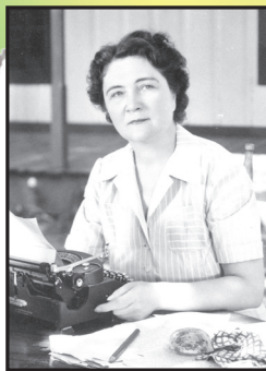
Marjorie Kinnan Rawlings seated at a table in her yard, 1952, age 56.

"Two roads diverged in a wood, and I— I took the one less travelled by, And that has made all the difference." - from The Road Not Taken (1916) by Robert Frost